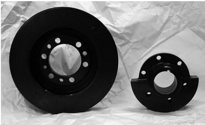
Damper Ring (A)

BALANCING OR MATCH BALANCING -Fluidamprs designed for externally balanced engines include the damper ring (A) bolted to a counter-weighted hub (B). See photo below.